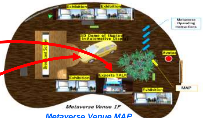
Metaverse Venue 1F Metaverse Venue MAP